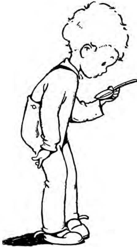
MICHAEL TOOK HIS MEDICINE.

It was the colour of milk; but the children did not have their father's sense of humour, and they looked at him reproachfully as he poured the medicine into Nana's bowl. "What fun!" he said doubtfully, and they did not dare expose him when Mrs. Darling and Nana returned.